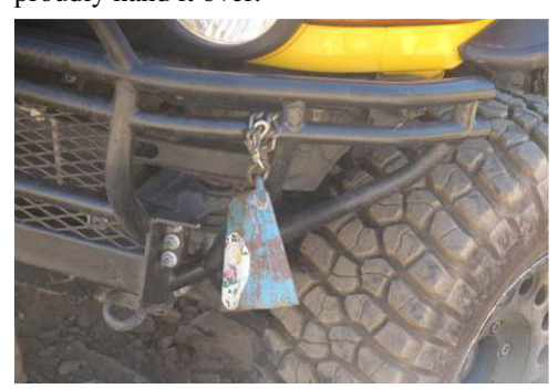
Proudly displaying the Cow Bell.

The cow bell rules are: If you get stuck and are unable to move under your own power and need the help of a winch or you get strapped from one of your fellow jeepers then you have earned the privilege of hanging a cow bell from your front bumper. You must leave the cow bell on the front of your rig until another Dirt Devil gets stuck then, you can proudly hand it over.