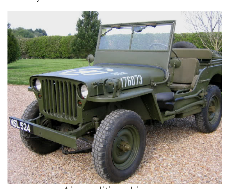
Air conditioned jeep