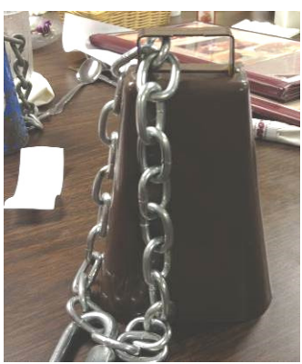
3 new brown bell

The cow bell rules are: If you get stuck and are unable to move under your own power and need the help of a winch or you get strapped from one of your fellow jeepers then you have earned the privilege of hanging a cow bell from your front bumper. You must leave the cow bell on the front of your rig until another Dirt Devil gets stuck then, you can proudly hand it over.