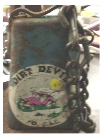
1 Old green cow bell.

Old Blue Mike Maneth Calico February 2012